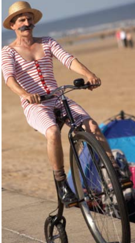
Bathing Beauties Festival, Mablethorpe