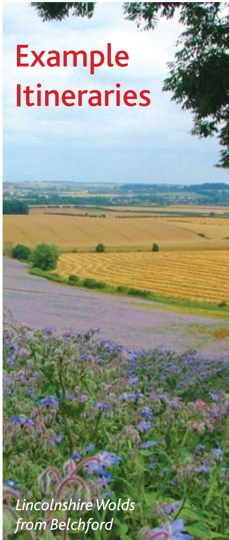
Lincolnshire Wolds from Belchford