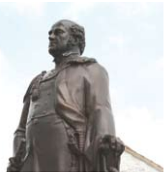
Sir John Franklin Statue, Spilsby

We have a long association with aviation, being home to several airbases with great strategic importance - and today we have some of the best aviation attractions in Britain.