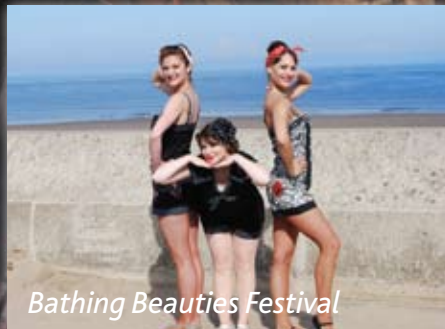
Bathing Beauties Festival