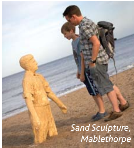
Sand Sculpture, Mablethorpe

Mablethorpe has always been a family favourite. With its two mile stretch of golden sand it is perfect to while away those long summer days. The popular Bathing Beauties Festival takes place every September. This popular coastal art festival will fill the beach and the beach huts of Mablethorpe, Sutton on Sea and Sandilands with a diverse assortment of artistic splendour, music, poetry, performances, photography, film and drama, there truly is something for everyone!