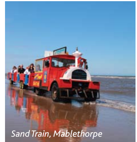
Sand Train, Mablethorpe

Spend a day exploring the seaside delights of Mablethorpe. Take a trip on the Road Train or Sand Train, or visit the Seal Sanctuary. Relax