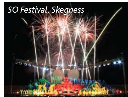
SO Festival, Skegness

a quiet area to sit and watch the world go by. Tower Gardens hosts many outdoor events for families in the summer months and at the Embassy Theatre you have the opportunity to see the stars on stage every night of the week.