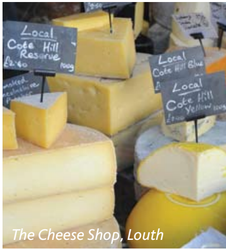
The Cheese Shop, Louth