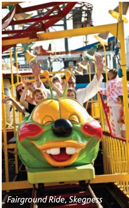
Fairground Ride, Skegness

Skegness , our largest resort, is renowned as one of the country's top seaside destinations. A coast of contrasts, Skegness seafront buzzes with funfair excitement, but the picturesque Compass Gardens offers