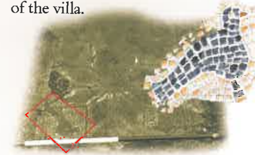
The image of the blackbird appears in all four corners of the mosaic

Kirmond le Mire has an interesting history to its name. Kirmond means goat hill, while le Mire means marshy ground. In the 1970s remains of a Roman villa were found in this area, including a mosaic that included an image of a blackbird. Unfortunately today there is no evidence on the ground of the villa.