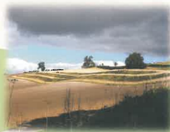
Medieval cultivation terrace

The walk is mainly on paths and tracks with some steep slopes and a number of stiles (some may be difficult for dogs). Some paths may be muddy, so stout shoes or boots are recommended. Allow 2½ -3 hours for the walk.